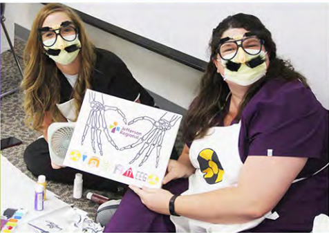
Employees were encouraged to show their creative side during Art Wars, and the finished artwork went up for sale during a silent auction!