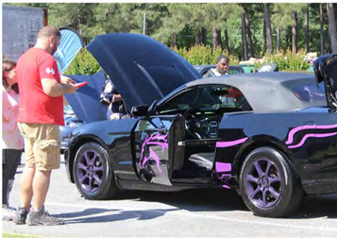
Fees were $20 per entry in the car show. That money, along with the silent auction cash from Art Wars, generated $1,176 for the Foundation.