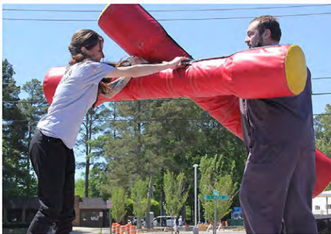
Jousting was a big hit at the picnic!